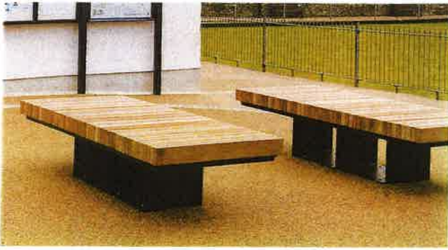
£1,723.00 Helston Straight Bench Broxap