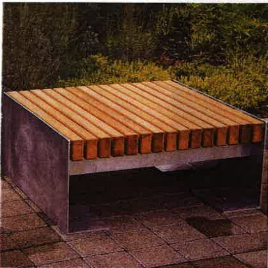
£1,665.00 Helston Broxap