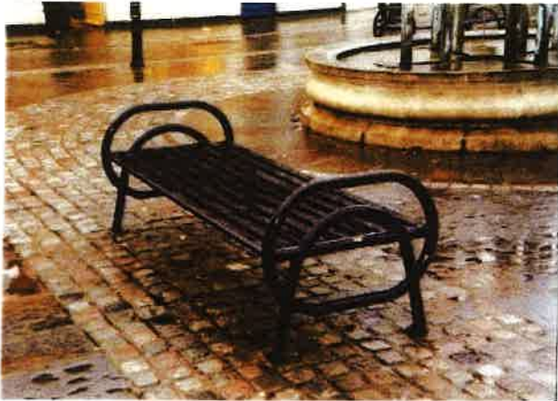
EH Steel Bench Anti-Vandal David Ogilvie 1800mm length £693 /2000mm length £811.

Price for a bolt down kit to secure the bench to a hard standing is £9.50. Delivery £105.