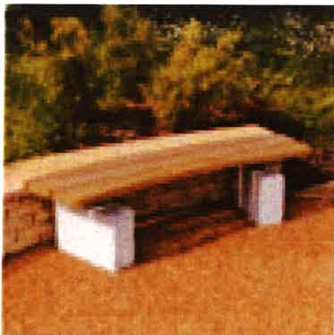
Sheldon bench Langley