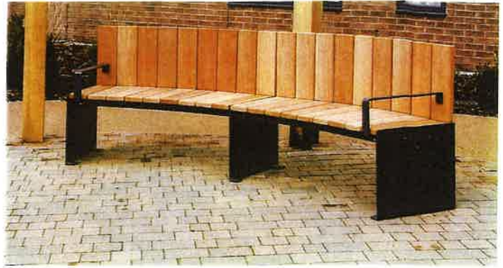
Eastthorpe Broxap (POA)