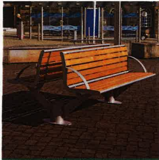
£996 Beckford Seat Broxap

TOWN IMPROV" CTEE LIKED BECKFORD SEAT - 9/4/19.