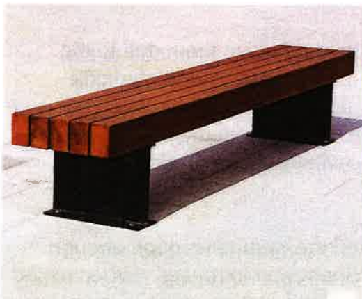
£952.00 Tiptree Bench Broxap

TOWN IMPROV" CTEE LIKED BECKFORD SEAT - 9/4/19.