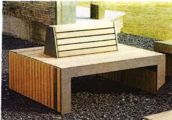
Plaza III S bench Broxap, with or without backrest (£2,476.00 with BR) Length: 1200mm Width: 1200mm Height: 450mm Weight: 145.5 kg.

Pictures just give an idea of what's available on the market should a replacement be the preferred option (note: prices are just a guide, there may be additional costs e.g. delivery/fixing kits).