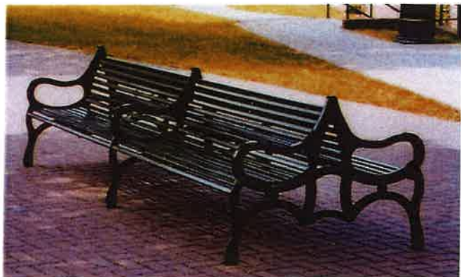
Anti-Vandal KC Steel Bench Seat David Ogilvie POA

Price for a bolt down kit to secure the bench to a hard standing is £9.50. Delivery £105.