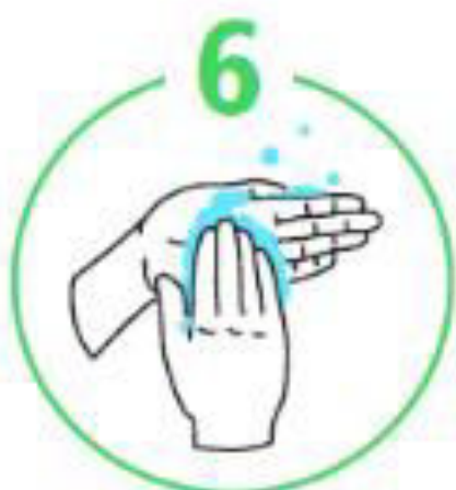
The tips of the fingers

Use a tissue to turn off the tap. Dry hands thoroughly.