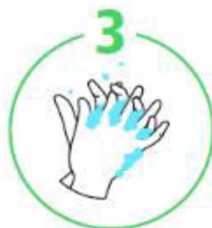
In between the fingers