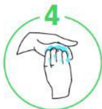
The back of the fingers