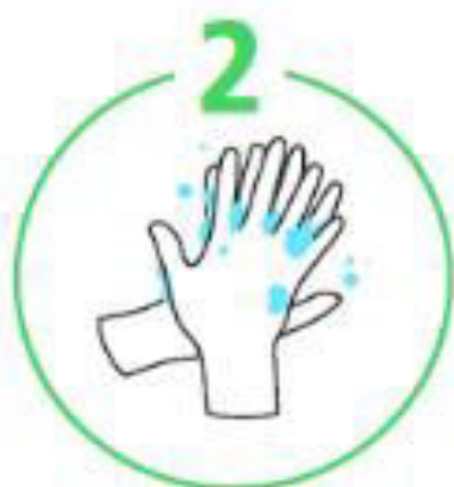
The backs of hands